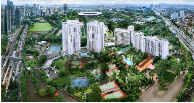
The Sultan Hotel & Residence Jakarta